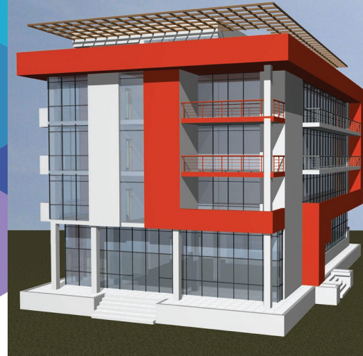
TYPE – No. 1